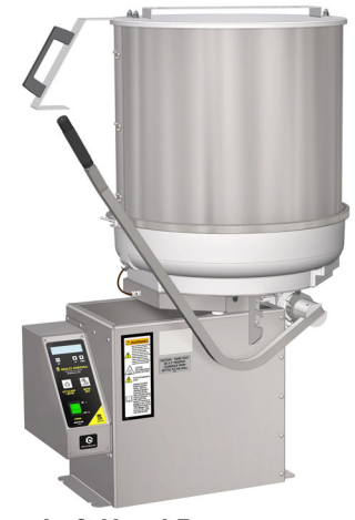
Left Hand Dump