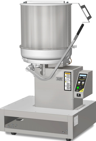
Mark 10, Right Hand Dump, shown on 2436-001 Base (sold separately).